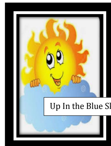
Up In the Blue Sky