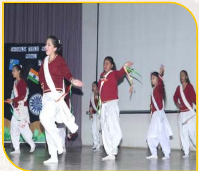
Freedom, Oxygen of Soul

Republic Day is a remarkable day in the history of India as this is the day when finally the Constitution of India came into effect on January 26, 1950. As part of the celebrations, a scintillating fly past and flamboyant march past by various classes. Students of classes VI-VIII participated in cultural dance at state level.