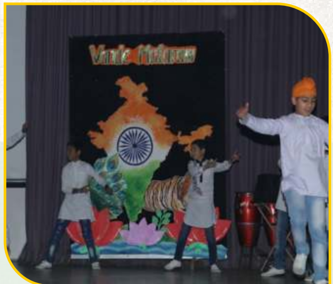
Be close, Be gallant for nation