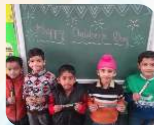
Learning is joyful

The school celebrated the children's day to pay tribute to the legendary freedom fighter and our 1st Prime minister Pandit Jawahar Lal Nehru popularly known as Chacha Nehru. Drawing competition and community lunch was organized.