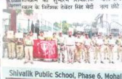
Shivalik Public School, Phase 6, Mohali