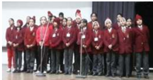
Let us sing together

Special assembly was organized in the school auditorium. Students of classes III-V participated with zeal and enthusiasm. Students presented spectacular dances , carols and skit followed by poems and speeches.