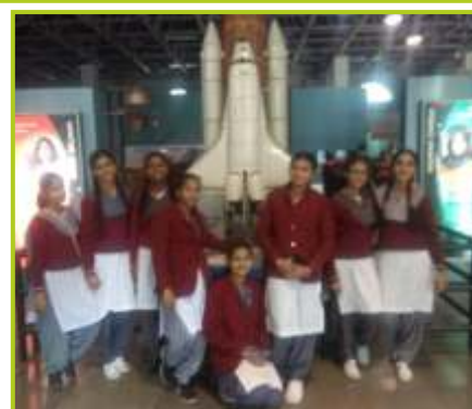
Learning Imprints on Gentle Minds