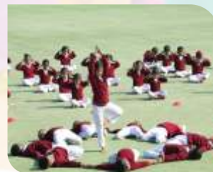
Healthy Body in Healthy Mind

"Arise, Awake and stop not till the goal is achieved" based on the same theme sports day was organized. It included events (50 metres race, hurdle race and book balancing race), drills (lazium, dumbbell, fan), yoga and aerobics. Students participated in the events with great zeal and gusto.