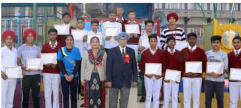
STANDING TALL WITH PRIDE