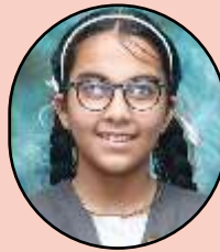
VII MISHTHI PIPLANI