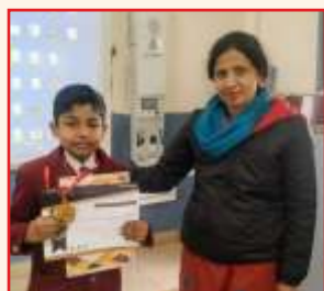
Dishant IV B