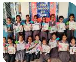
Every child has an artist within

Festivals are a powerful, rhythmic force in connecting children to nature in a predictable way. Diwali the festivals of lights, sound and fun galore was eagerly looked forward by the children to celebrate and enjoy. The students made kandil and diyas using origami sheets. Nature walk was organized to give the message of "eco-friendly and green diwali". Bright colours of rangoli spread bright smile on their faces. Children enthusiastically participated in it.