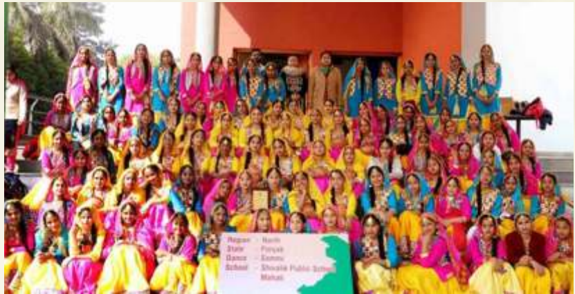
Adding glories to the School