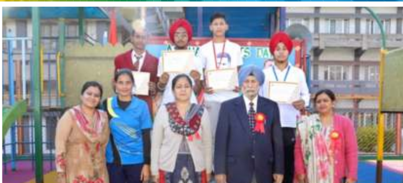
EXPRESSION OF CONTENTMENT