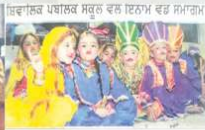
शिवालिक पब्लिक स्कूल दल टिनाम दंड समारोह

शिवालिक पब्लिक स्कूल दल टिनाम दंड समारोह... (Shivalik Public School team performs Dandia Raas ceremony...)