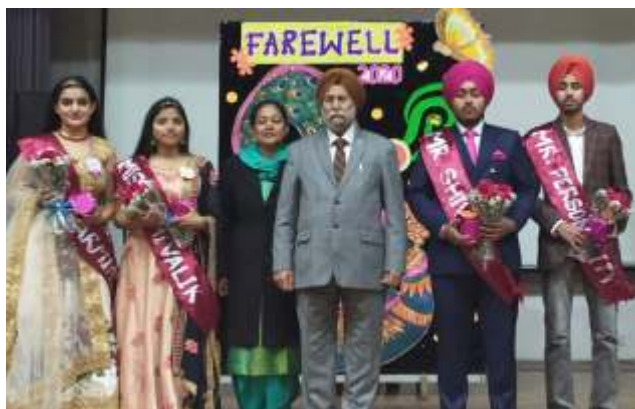
Taking a flight of life