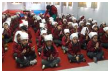
Holy occasion solemnisation