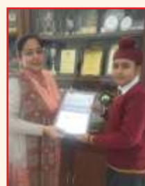
Harjas VI B