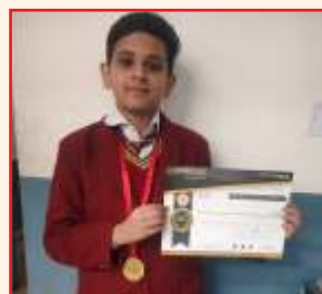
Swaran VII A