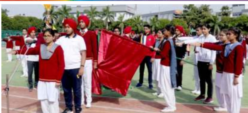
TAKE THE LEAD