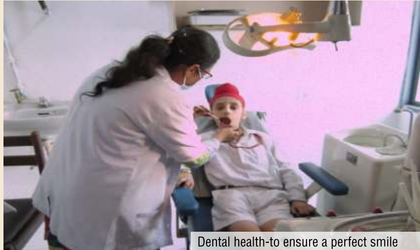
Dental health-to ensure a perfect smile

ATL is a workspace where young minds can give shape to their ideas through hands-on do-it-yourself