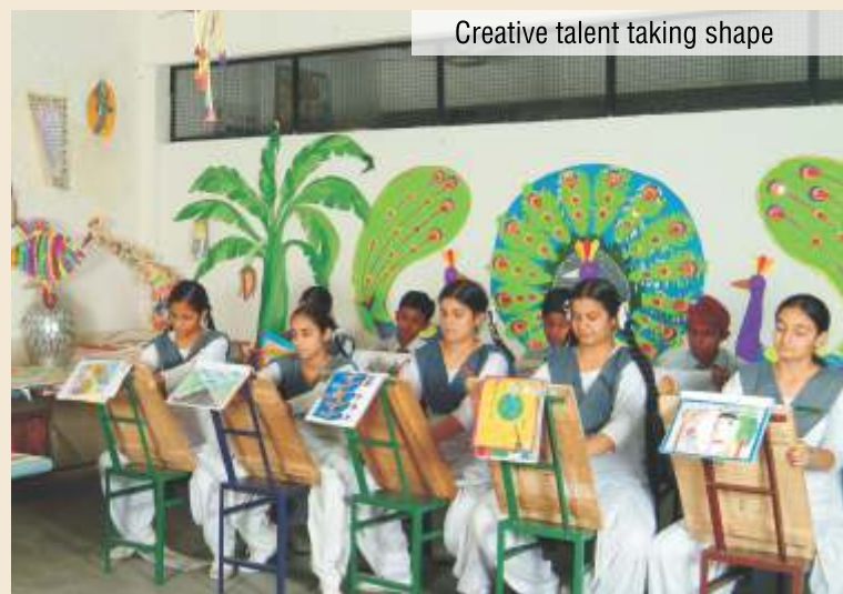
Creative talent taking shape

To enhance creativity of the students, Art and Craft section plays an important role. Students are taught the art of painting including emboss, nib, oil and glass painting. Students are also taught to develop their skills by way of making origami, thumb painting, coin painting, mask making, pattern making etc.