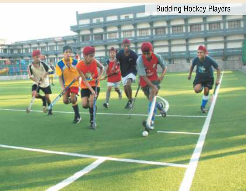
Budding Hockey Players

Games and sports bring out the best in a child and enables one to channelise one's energies in useful and gainful pursuits. In the field of sports, our school occupies a place of pride and can boast of both national and International players who have brought us laurels. In order to provide a boost to sports and enable healthy competition in the region, tournaments are organized regularly. The School sponsors running trophies for various sporting events like cricket, hockey, basketball, football and volleyball. In addition, students are also initiated into participating in races, athletics and gymnastics.