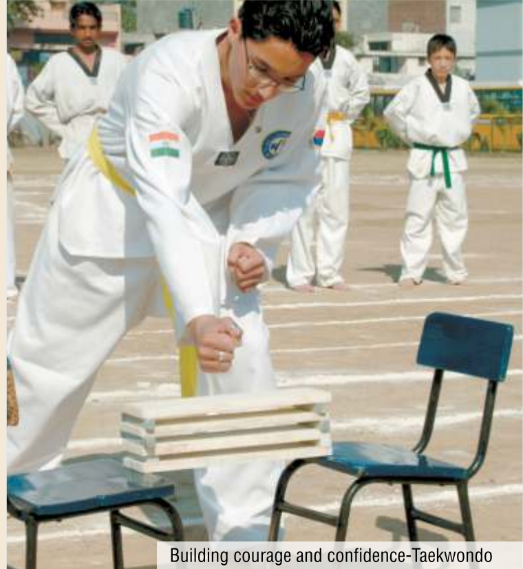
Building courage and confidence-Taekwondo

We feel each child has the potential, so 'participation for all' is the key principle. Group activities that include aerobics, gymnastics, drills, dance and bhangra are held on a regular basis. In an hour-long session every week, we ensure that every student gets an opportunity to participate in either of the activities.