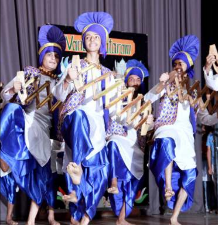
Our Cultural Heritage