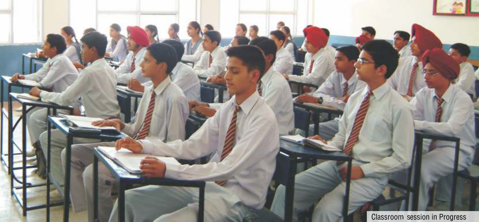
Classroom session in Progress