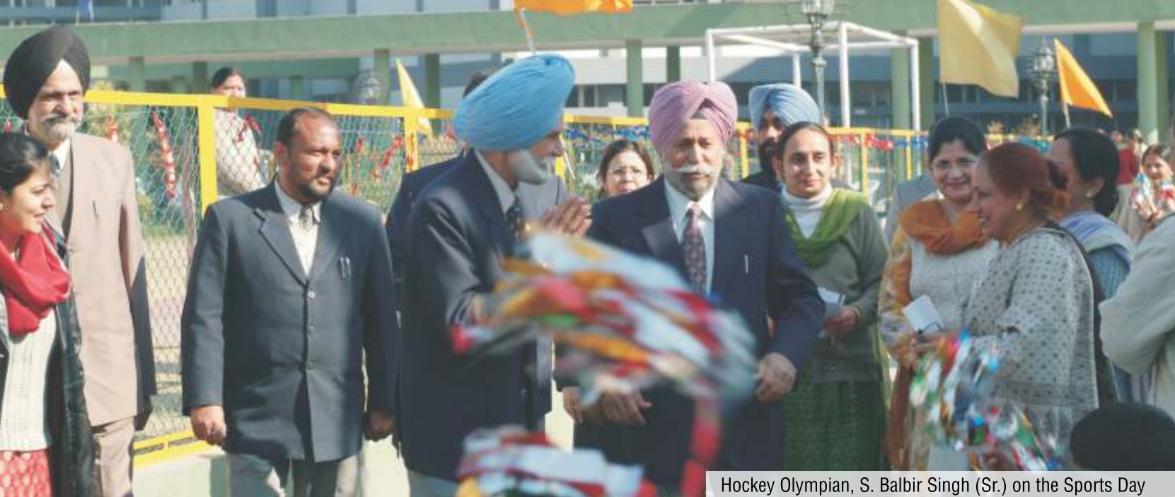
Hockey Olympian, S. Balbir Singh (Sr.) on the Sports Day