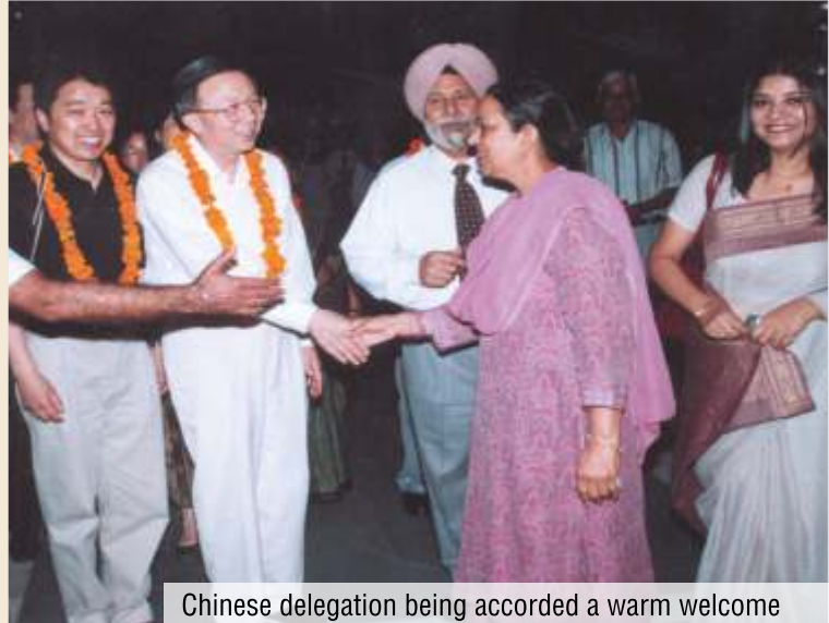
Chinese delegation being accorded a warm welcome

Education is the harmonious development of the faculties of a child. It does not only consist of learning of rudiments of certain subjects in order to qualify some examinations but is the continuous enlightenment of the mind. Unless different things learnt are absorbed and merged into a living