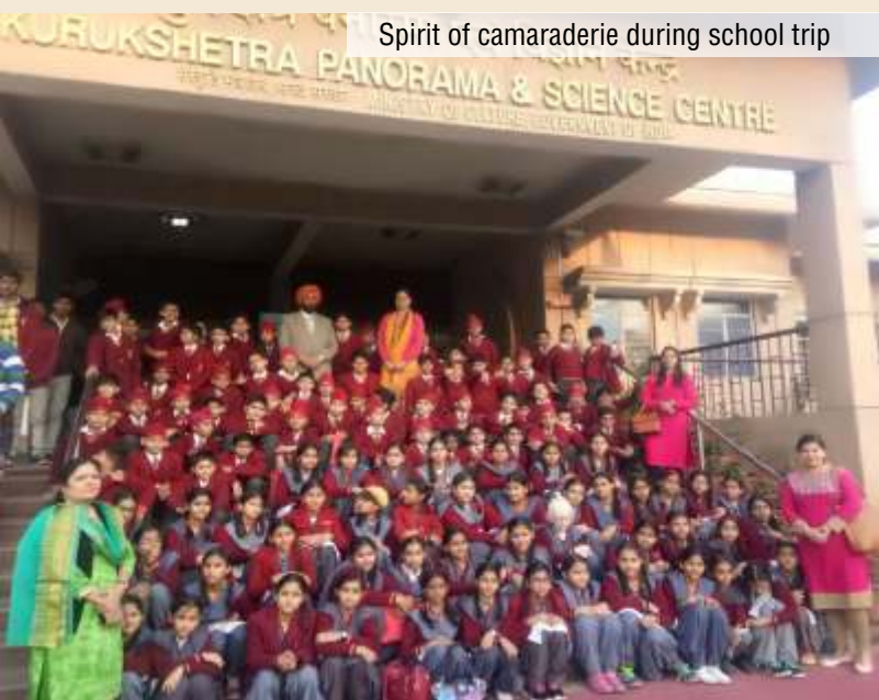
Spirit of camaraderie during school trip

Bus transport, is provided on request to students residing in Chandigarh and Mohali only. The bus fare is charged for a period of 11 months. A student availing the transport facility cannot withdraw voluntarily during the session. Withdrawal may be allowed only in those cases where the parents of the student have been transferred or have shifted their residence to a nearby sector.