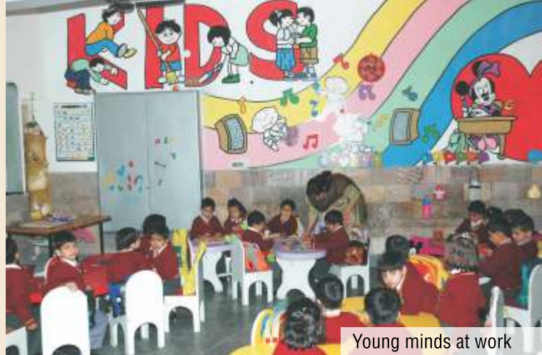
Young minds at work

To nurture a positive self-concept in children, emphasis is laid on play-way methods. Music plays a