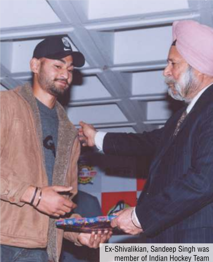
Ex-Shivalikian, Sandeep Singh was member of Indian Hockey Team

In-service teacher training is a regular feature. Workshops and seminars are organized to keep the members of the teaching faculty abreast with latest innovations in the field of education. This enables the teachers not only to disseminate new information to the students but also incorporate the latest methodologies to enhance the process of teaching and learning.