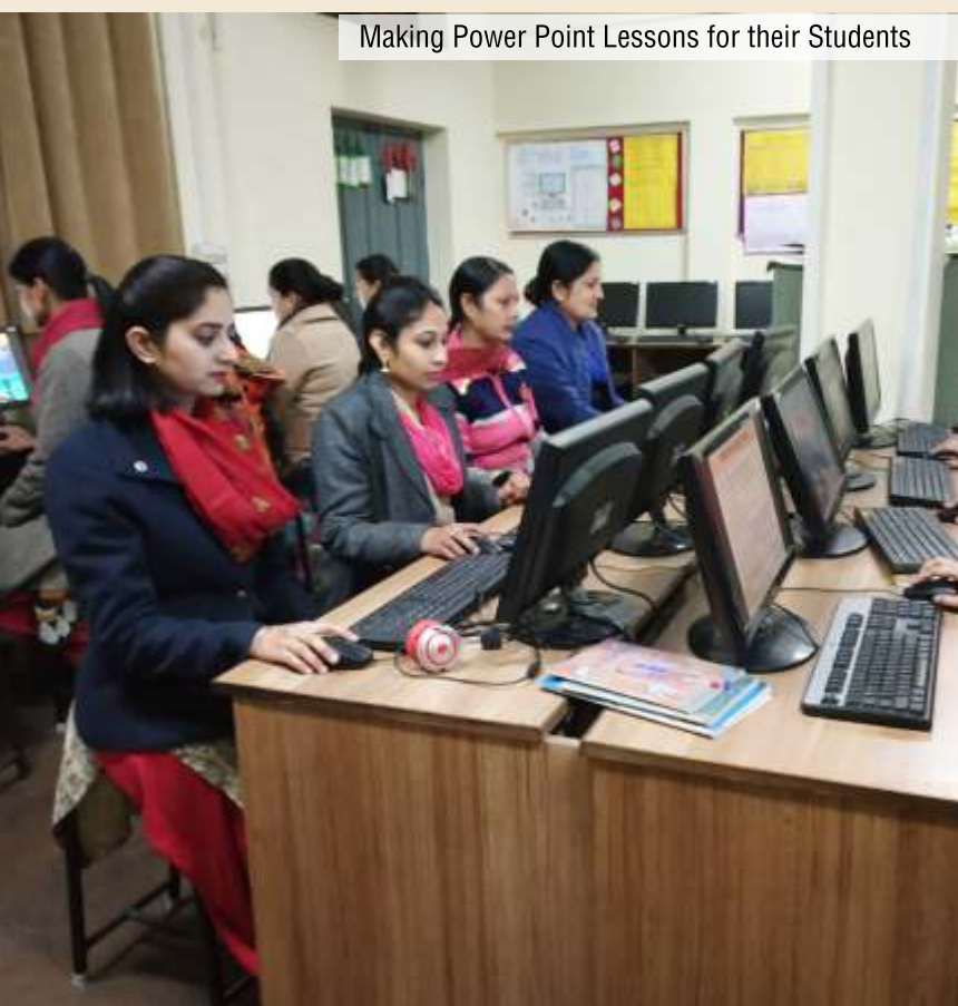
Making Power Point Lessons for their Students

Smart Class - The school is one of the first institutions in the region to adopt Smart class concept. It is a technology assisted teaching aid which improves teacher effectiveness and productivity, makes learning an enjoyable experience