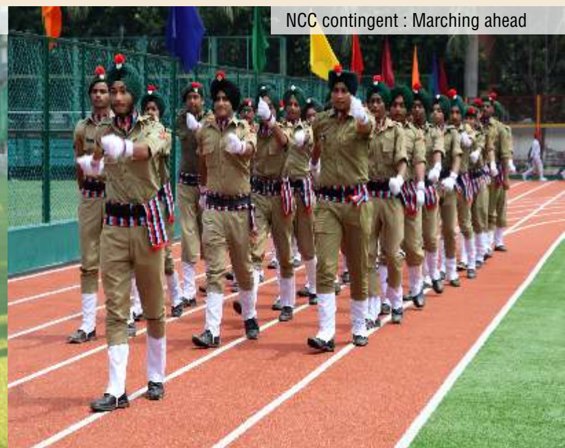
NCC contingent : Marching ahead