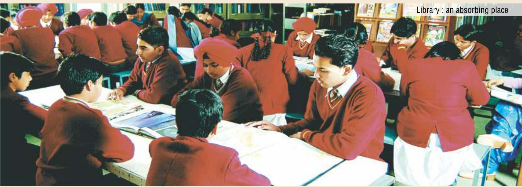
Library : an absorbing place

Language Lab offers distinct opportunity to the students to learn effective communicative skills. The focus is laid on correct pronunciation, right stress and intonation. Using linguaphones and audio-aids, voice modulation is also taught. It enhances their communication skills and interest to participate in declamations, debates and group discussions.