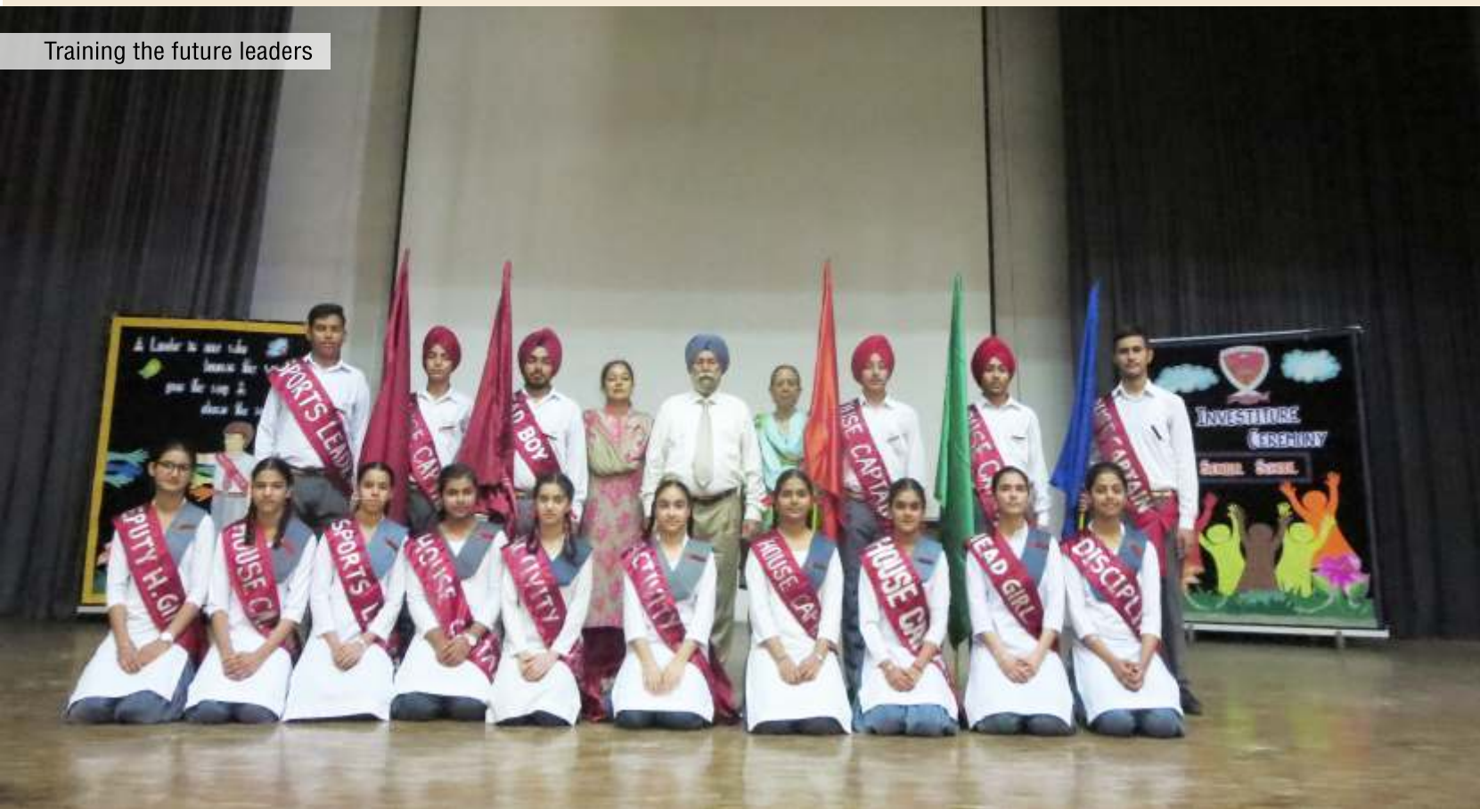
Training the future leaders

To instil discipline and enable students to shoulder responsibilities, the School Council is sworn in at an Investiture Ceremony. Appointments for all houses i.e. Pratap, Azad, Ranjit and Subhash House are conducted which not only provide a platform to the students to express themselves but also motivate them for a responsible leadership.